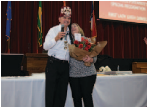
"She'd rather have roses than a plaque."