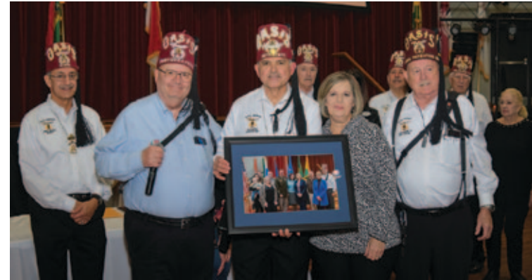
Noble Les Dix presents a family portrait