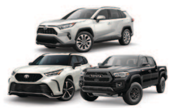
JEEP WRANGLER | JEEP GRAND CHEROKEE | RAM 1500 | GMC SIERRA 1500 DENALI | GMC ACADIA AT4 | GMC YUKON DENALI | TOYOTA RAV4 | TOYOTA HIGHLANDER | TOYOTA TOCOMA