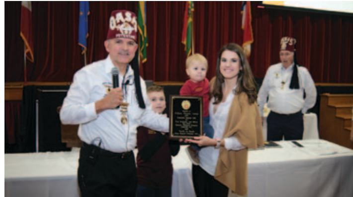
Ill. Grandsons receive an award