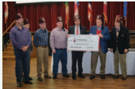
First place club in giving goes to Robbinsville Shrine Club