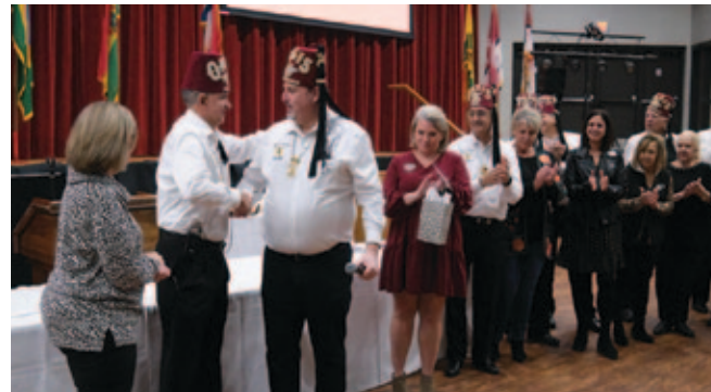
Handshakes and hugs