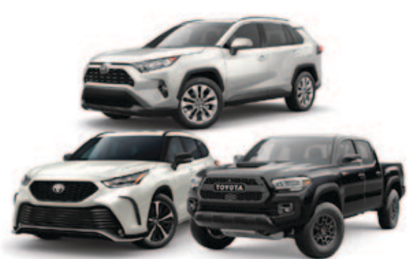
JEEP WRANGLER | JEEP GRAND CHEROKEE | RAM 1500 | GMC SIERRA 1500 DENALI | GMC ACADIA AT4 | GMC YUKON DENALI | TOYOTA RAV4 | TOYOTA HIGHLANDER | TOYOTA TOCOMA