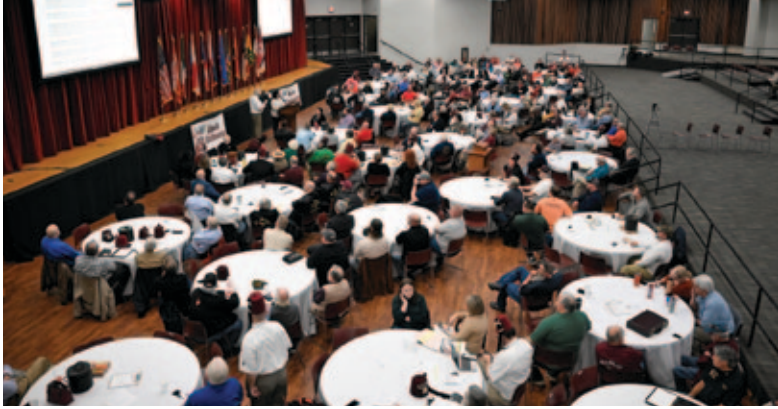
Over 200 Nobles and ladies took part.