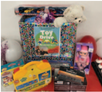
Levi's Toy Drive is well underway.