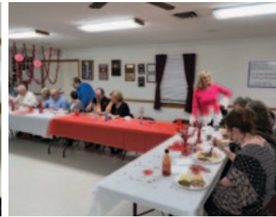
Guests enjoy fellowship and a yummy buffet.