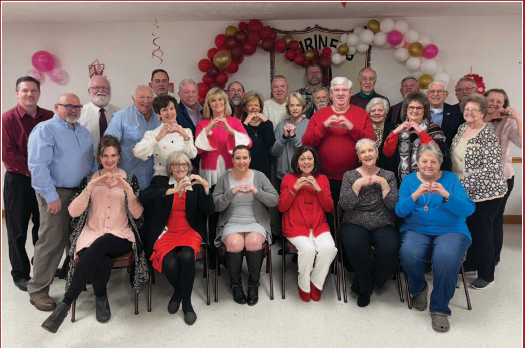
SURRY SHRINE CLUB